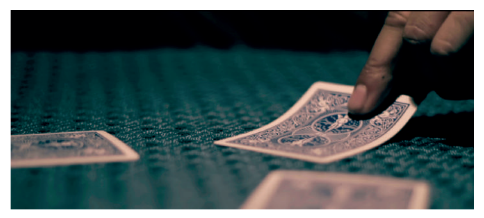
""The poetic image is a sudden salience on the surface of the psyche".